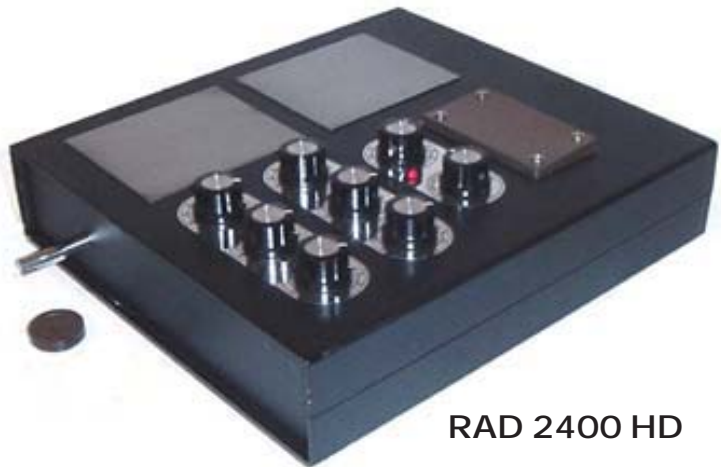
RAD 2400 HD